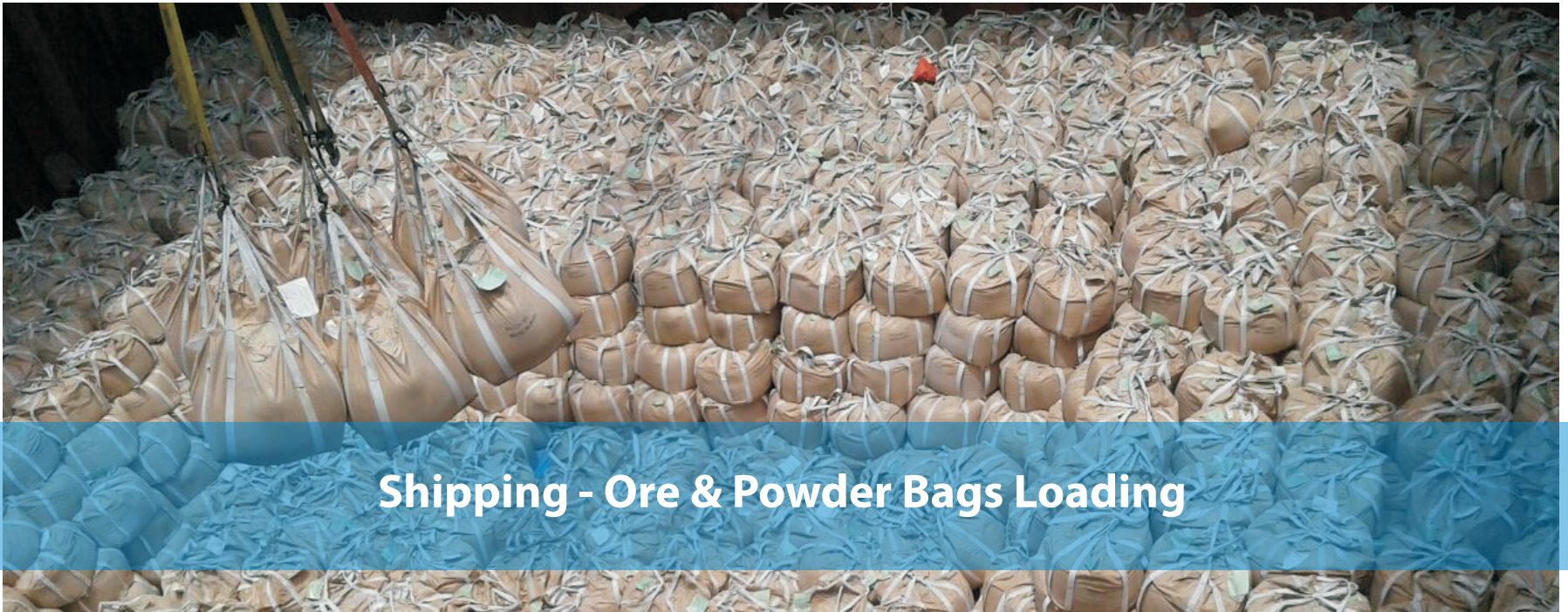
Shipping - Ore & Powder Bags Loading